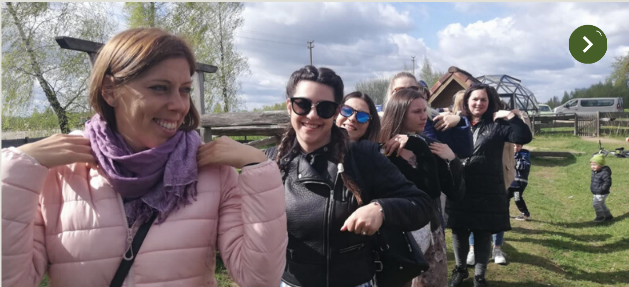
Picture7. Partner teachers during outdoor team activity in guest school "Melkys", Lithuania.