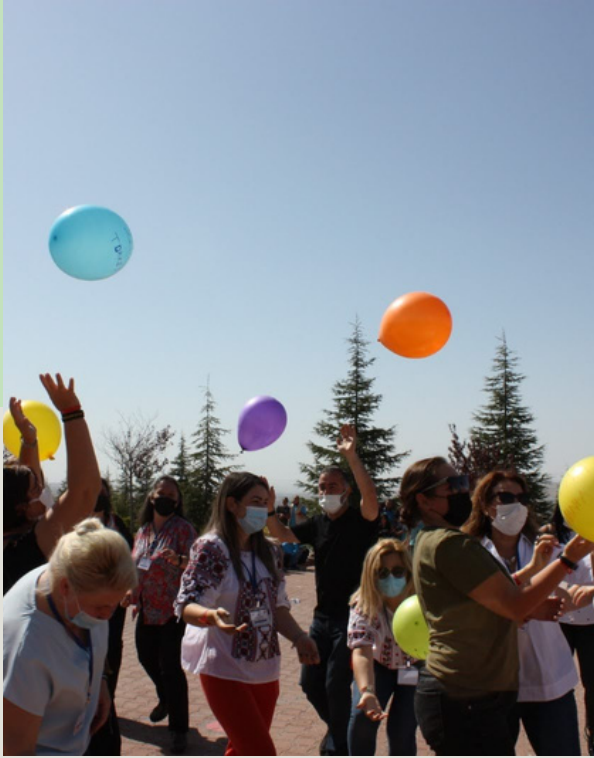
Picture4.Partner teachers during team-building activity in Menekşe Ahmet Yalçınkaya kindergarten, Kırşehir, Turkey.