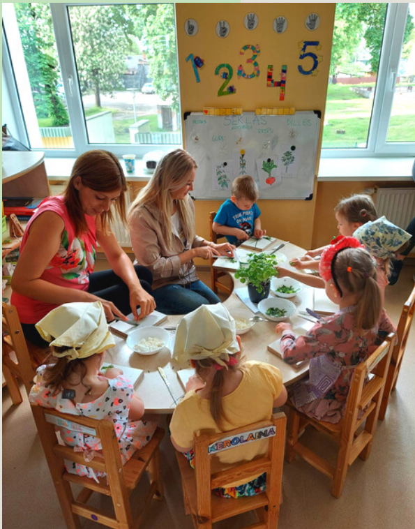
Picture2. "From garden to table" activity in Daugavpils 13th preschool educational institution "Sunny bunny".

During the first term of the project, the participating teachers have been actively creating and sharing their ideas and activities through a variety of channels. Overall, the project is progressing well as teachers have successfully come up with an interesting and attractive curriculum, they are sharing and discussing the teaching materials, and they are providing mutual support and feedback. By providing teachers with the necessary tools and resources to inspire a greater understanding and appreciation of nature among young children, the project is on track to achieving its goal of fostering a lifelong love of the natural world.