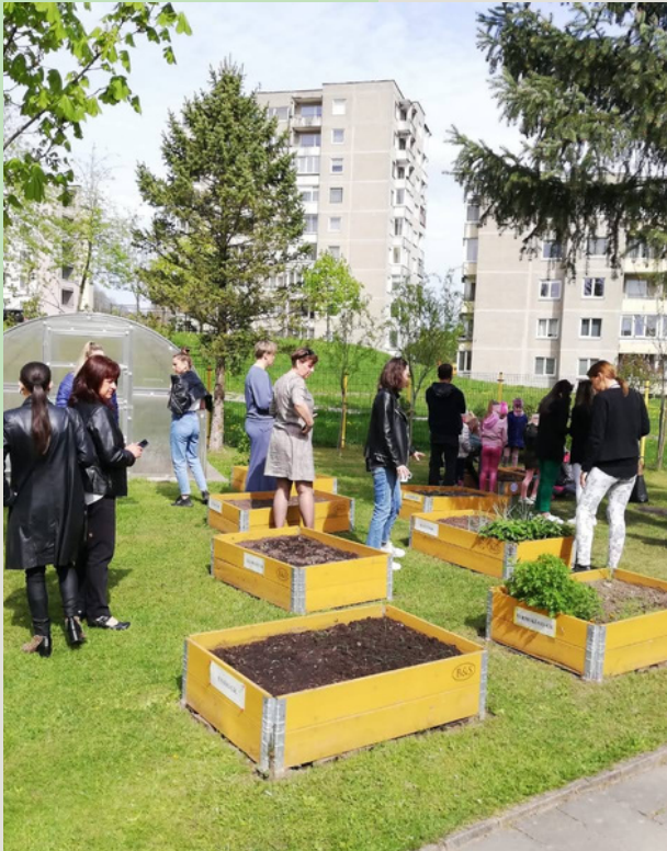
Picture5. Partner teachers observing an educational garden area at kindergarten "Volungele" in Alytus, Lithuania.