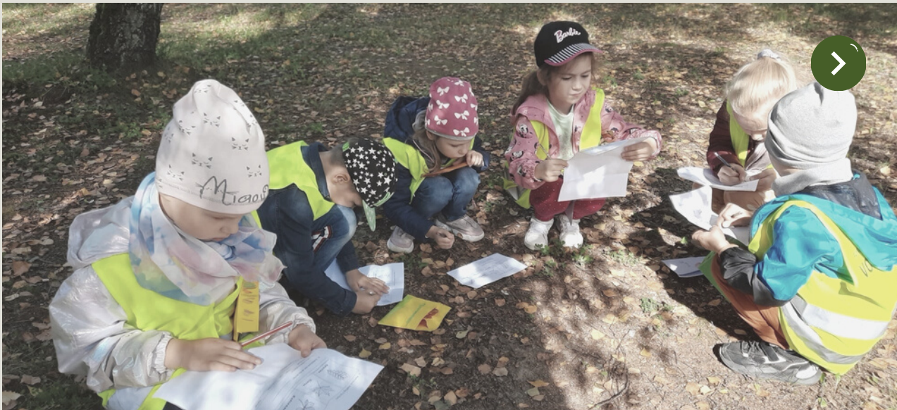
Picture1. "Volungele" students as nature detectives, Alytus, Lithuania