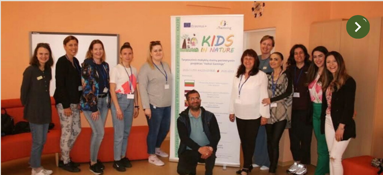
Picture3. Teachers from partner kindergartens during C2 mobility in "Volungele" kindergarten.